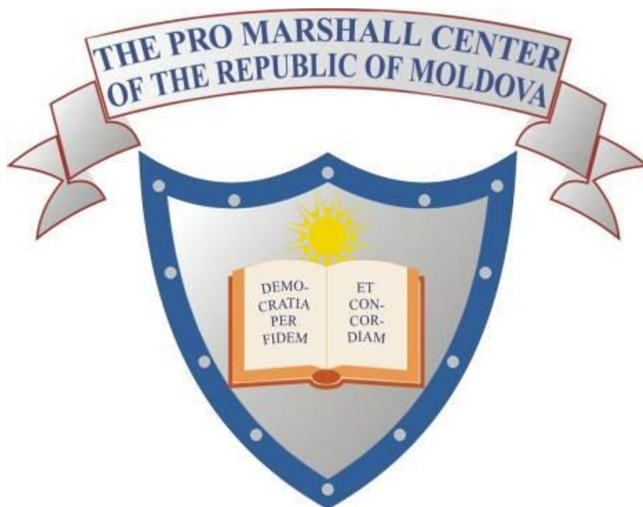
THE SYMBOL OF PUBLIC ASSOCIATION „PRO MARSHALL CENTER OF THE REPUBLIC OF MOLDOVA” (Registered by the decision of the Ministry of Justice of the Republic of Moldova from 28 of January 2009, nr. 5) Description

The symbol of the public association “The Pro Marshall Center of the Republic of Moldova” is represented by a buckler, with the Sun and an open book, which symbolizes knowledge as the source of life.