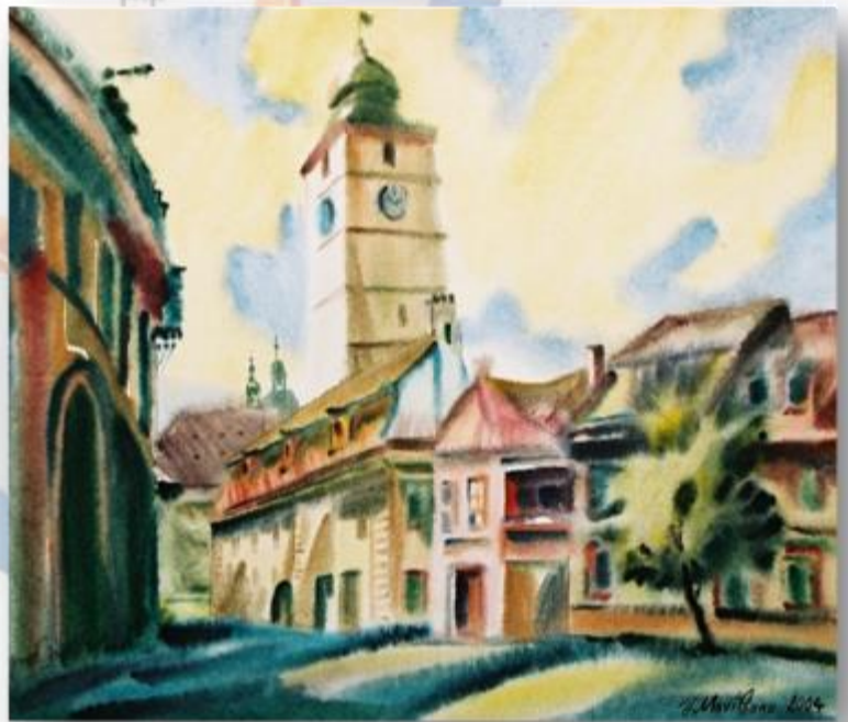
Sibiu – landscape of eternal reality